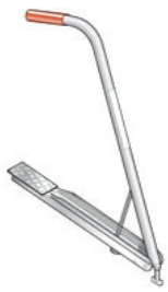
FS7A Pedal Assisted Lifting Handle